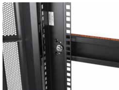
Loosen nut to adjust rail depth position