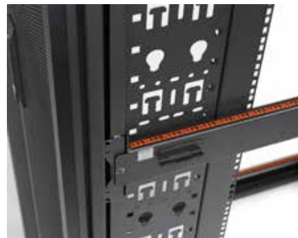
Vertical cable management bar, easy to align vertical rails